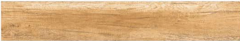
CANYON OAK BROWN