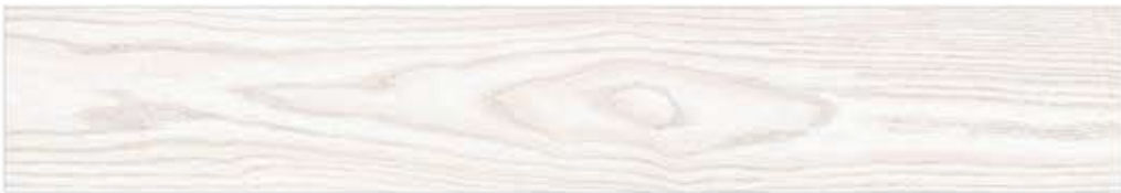
VELA BLANEA WHITE