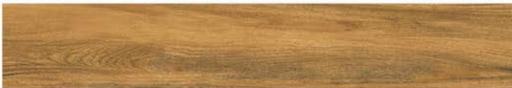
NEW WOOD LAND BROWN