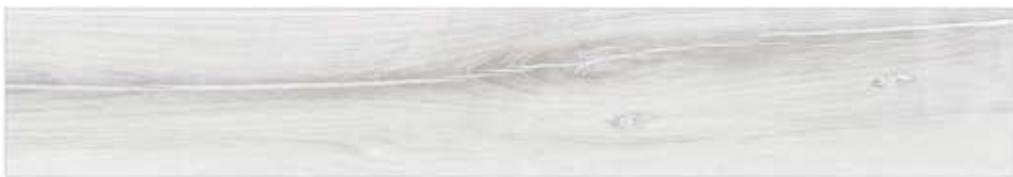
PINE NATURAL WHITE