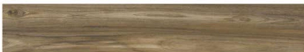
FOREST WOOD LEAFY