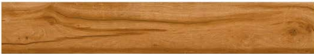
KARVEL DARK BROWN