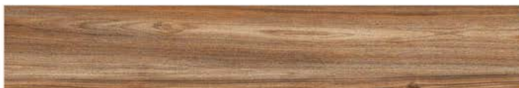
FOREST WOOD RUSET