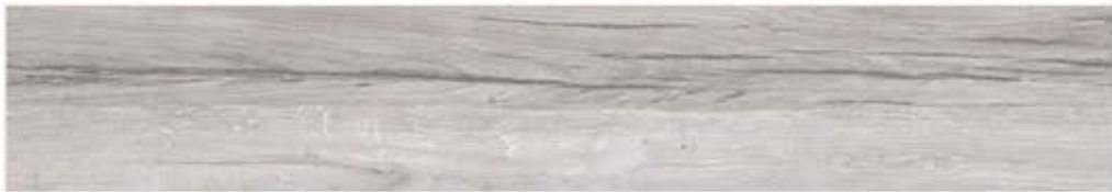
WILD WOOD LITE GREY