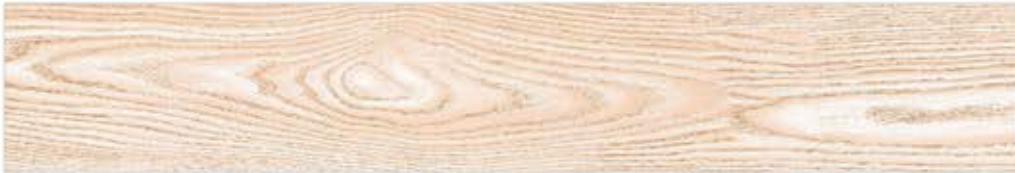
VELA BLANEA CREMA