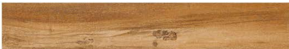
OAK WOOD BROWN