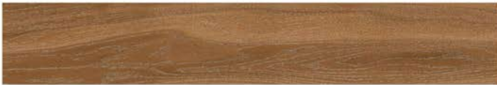
STAIN WOOD BROWN