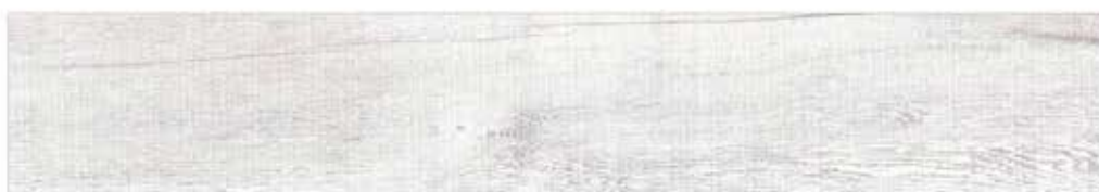
FOSSIL JAVA WHITE