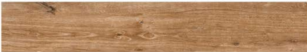
KASHMIRI WOOD NATURAL