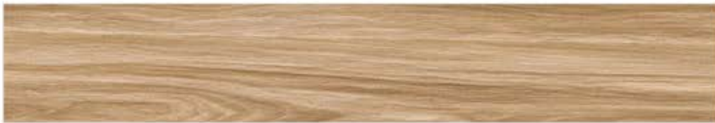
GRAIN WOOD WEAT