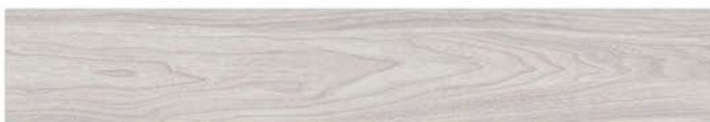
ALPINE LITE GREY