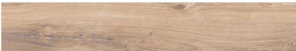
KASHMIRI WOOD TEAK