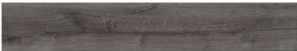
PINE NATURAL GREY