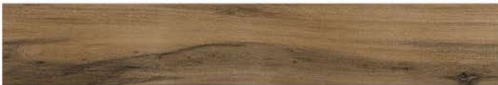
NEW SANDWOOD ALMOND