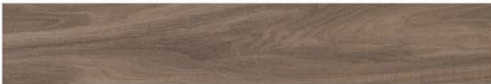
STAIN WOOD NATURAL