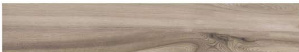
EGYPTION WOOD OLIVE