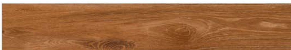
TERRA WOOD BROWN