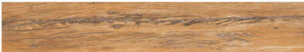
WILD WOOD NATURAL