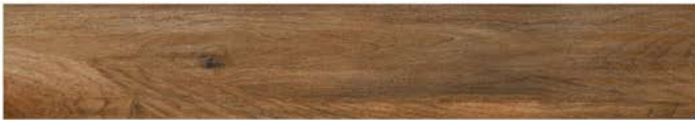
RAULI WOOD BROWN