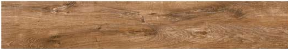
KASHMIRI WOOD BROWN