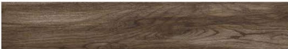
RAULI WOOD NATURA