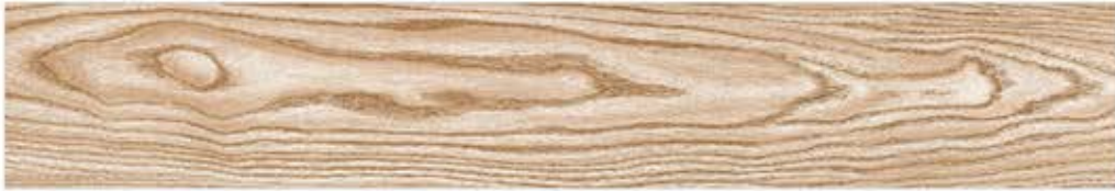
VELA BLANEA BEIGE