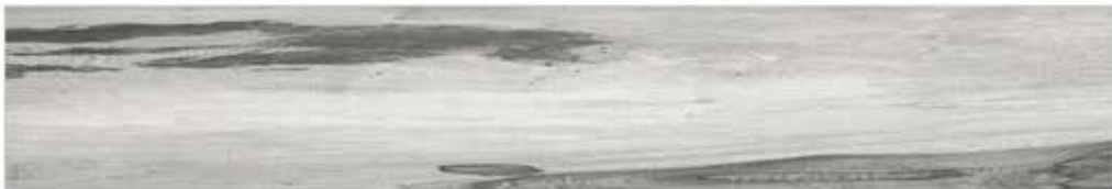
SVART LITE GREY