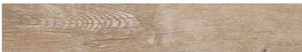
CANVAS WOOD WEAT