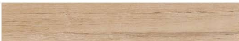
TERRA WOOD CREMA