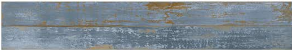
KEN WOOD BLUE