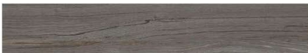
TERRA WOOD GREY