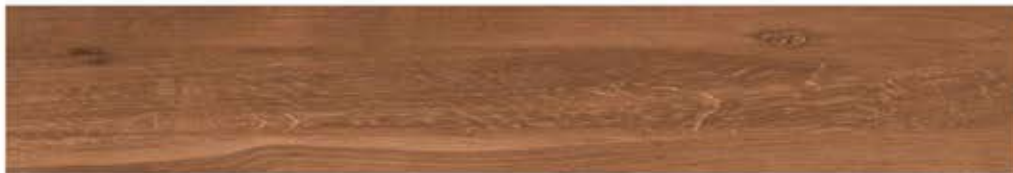
PINE NATURAL BROWN