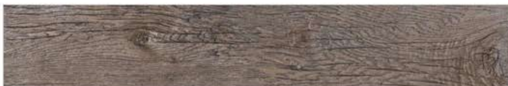
CANVAS WOOD GRISS