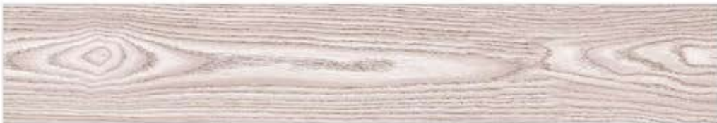
VELA BLANEA LITE CHOCO