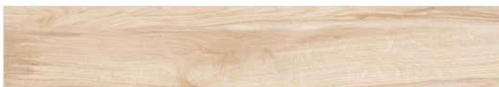
CLARA WOOD CREMA