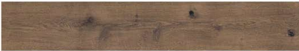
TIMBER WOOD NATURAL