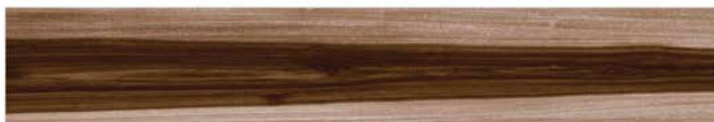
AFRICAN WOOD RED