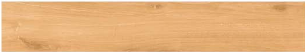
PINE NATURAL BEIGE