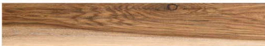
AFRICAN WOOD NATURAL