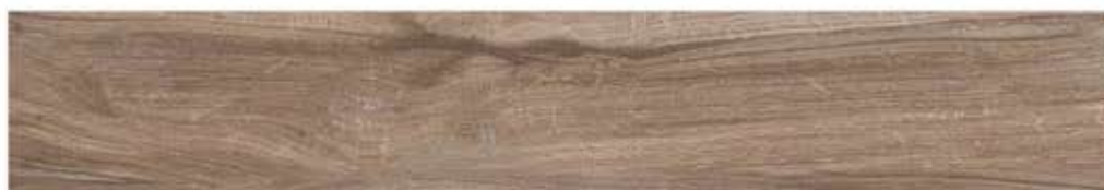
CLARA WOOD NATURAL