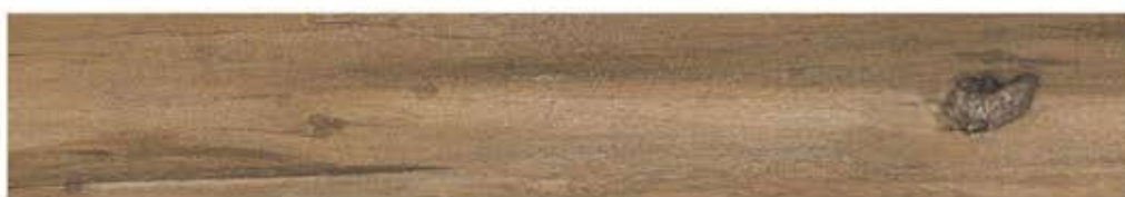
OAK WOOD NATURAL