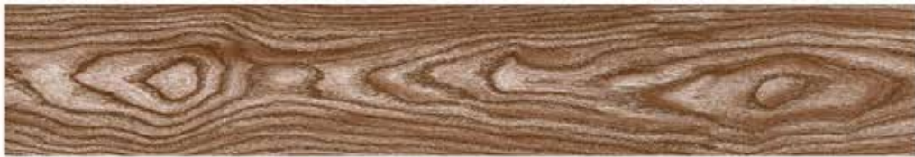
VELA BLANEA DARK CHOCO